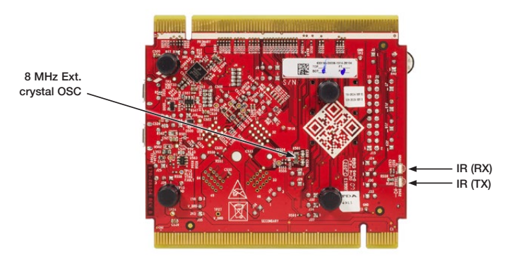
Figure 2: Back side of TWR-KL43Z48M module